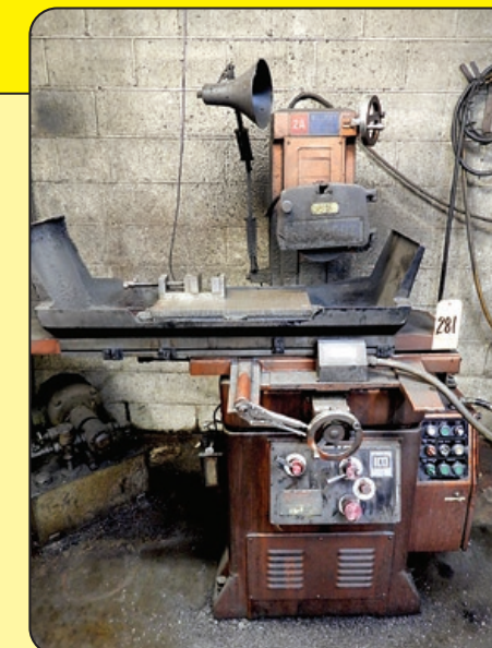
Millport Model 2A-818 2-Axis Hydraulic Surface Grinder