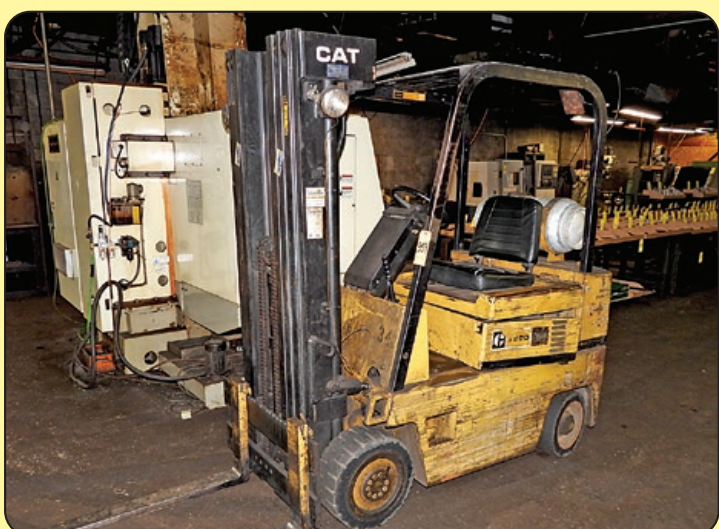
Caterpillar 5000 Lbs Capacity Forklift