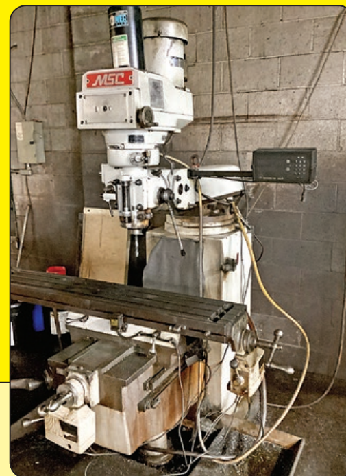
MSC 3HP Variable Speed Vertical Mill

AUCTION BEGINS CLOSING TUESDAY, MAY 12, 9:00 AM ET