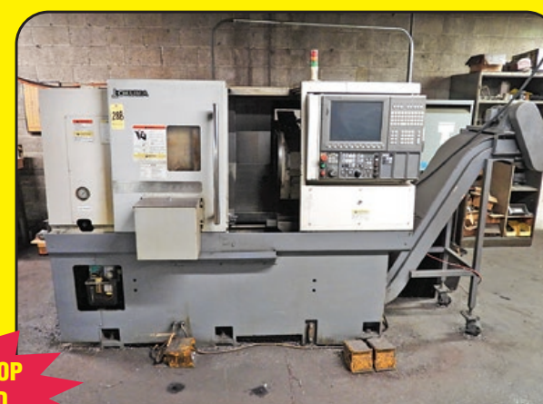
Okuma Model GENOS L300-M CNC Turning Center

TOOL & DIE SHOP BUILDING SOLD, MUST VACATE!