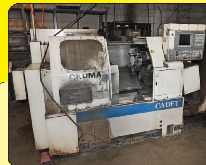
Okuma Cadet LNC8 CNC Turning Center

Inspection: Monday, May 11, 10:00 AM - 4:00 PM ET