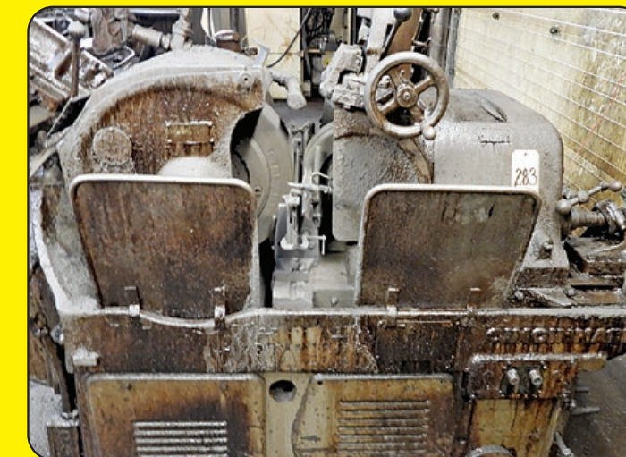
Cincinnati Model 2-OM Centerless Grinder