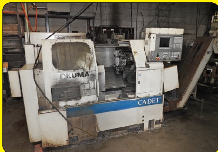
Okuma Cadet LNC8 CNC Turning Center

AUCTION BEGINS CLOSING TUESDAY, MAY 12, 9:00 AM ET