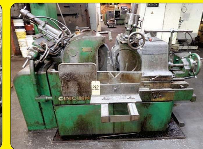
Cincinnati Moel 2-OM Centerless Grinder