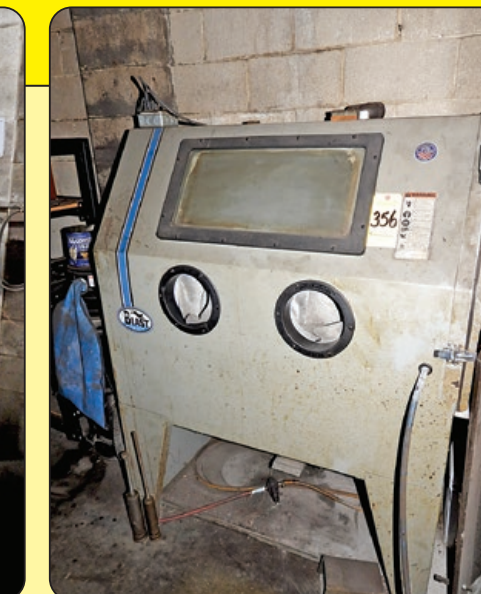
Skat Blast 24"X42" Dry Blast Cabinet