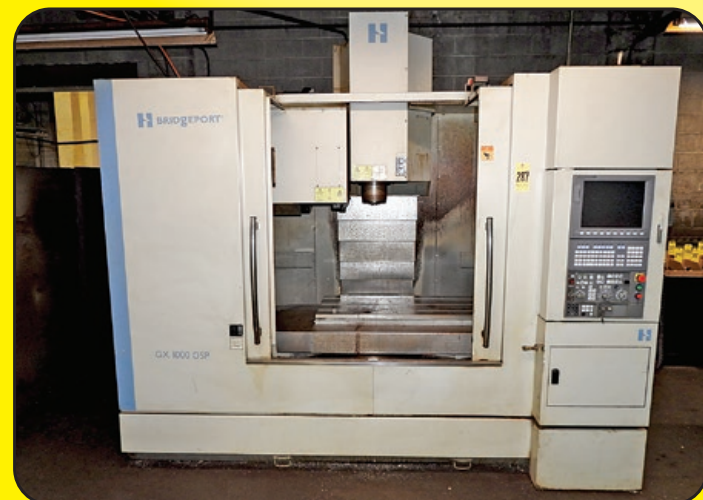
Hardinge/Bridgeport Model GX-1000-OSP Vertical Machining Center

AUCTION BEGINS CLOSING TUESDAY, MAY 12, 9:00 AM ET