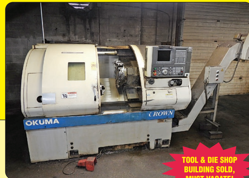
Okuma Crown 7625-SB CNC Turning Center

TOOL & DIE SHOP BUILDING SOLD, MUST VACATE!