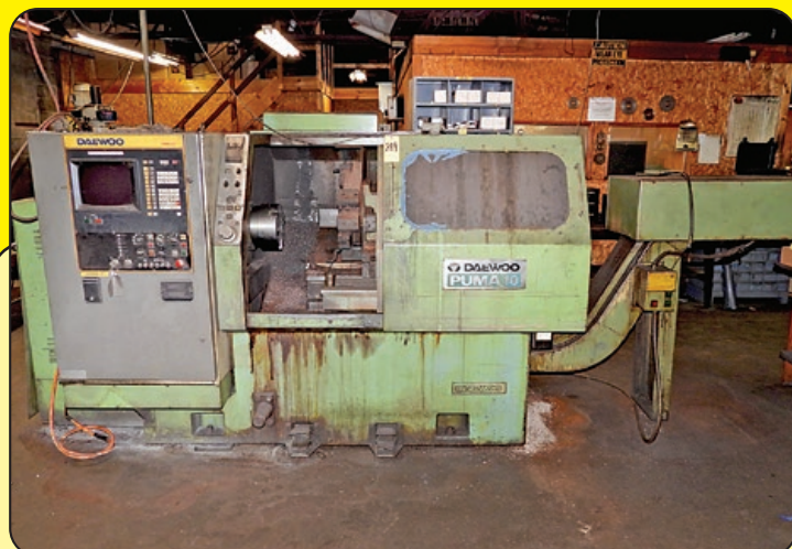
Daewoo Puma 10 CNC Turning Center