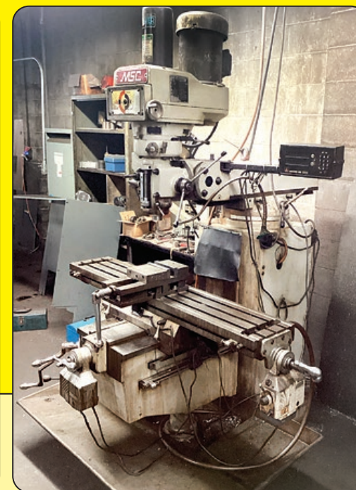
MSC 3HP Variable Speed Vertical Mill