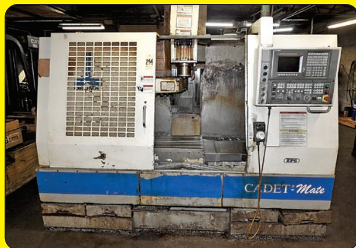
Okuma Cadet-Mate Vertical Machining Center