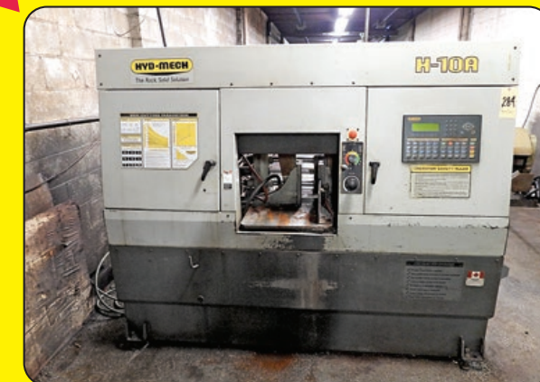
Hyd-Mech Model H-10A Automatic Horizontal Band Saw