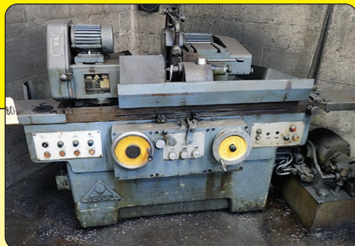
Jack Mill Model GU750H Cylindrical Grinder