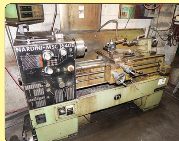
Nardini Model 1640E Toolroom Lathe