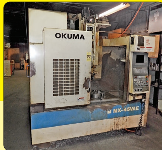
Okuma Model MX-45VAE Vertical Machining Center