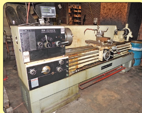
Magna Turn Model RK-2280ZX Toolroom Lathe