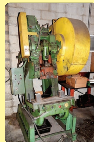
Rousselle #6 OBI Punch Press