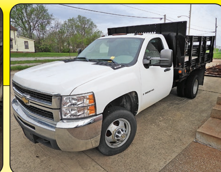
2009 Chevrolet 3500 HD Stake Bed Truck, Low Miles