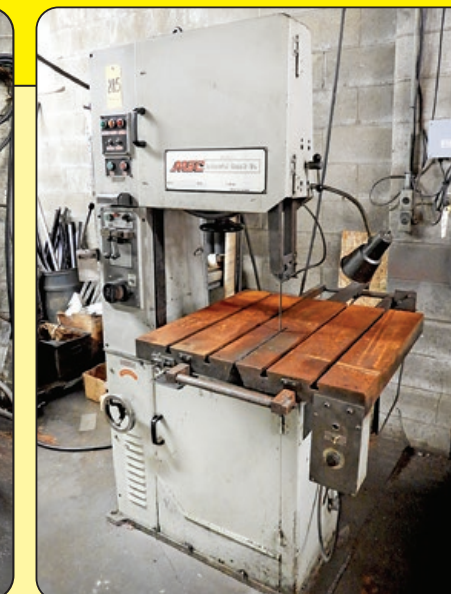
MSC 20" Metal Cutting Vertical Bandsaw