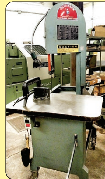
Roll-In Universal Band Saw,