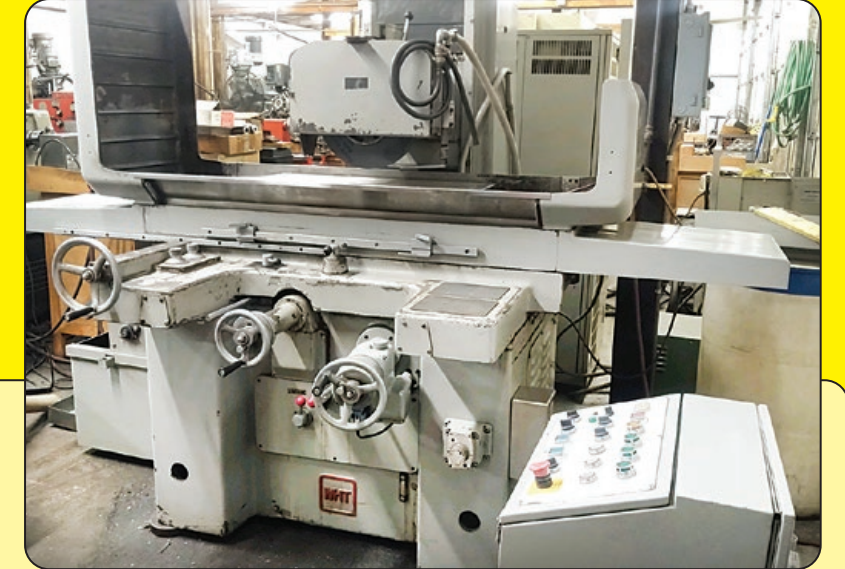
Mitsui 15.75" X 31.5" Surface Grinder