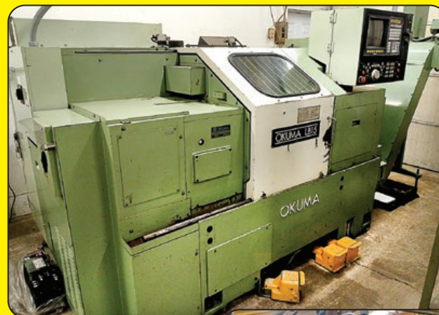
Okuma LB-15 CNC Turning Center