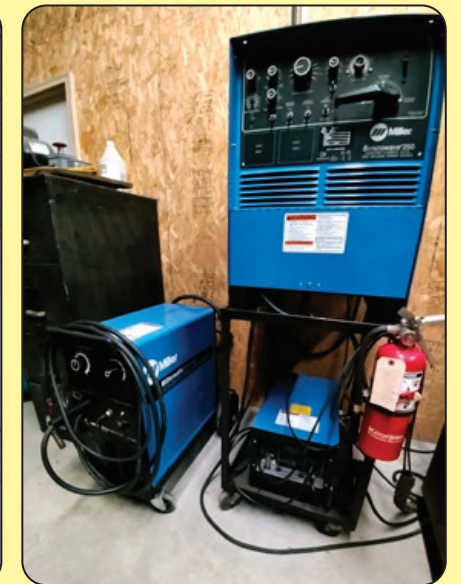
Miller Mig & Tig Welder