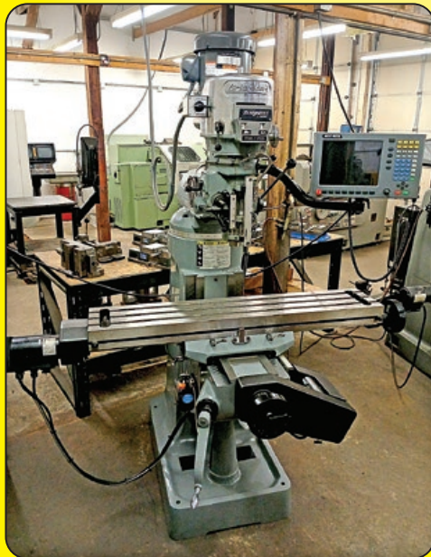
Bridgeport Series I, 2 HP CNC Vertical Mill