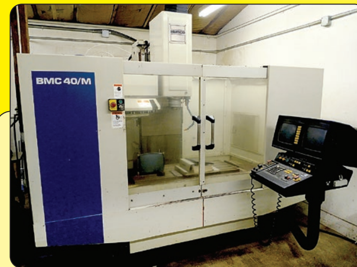
Hurco CNC Vertical Machining Center

Inspection: Monday, May 4, 9:00 AM – 4:00 PM EST