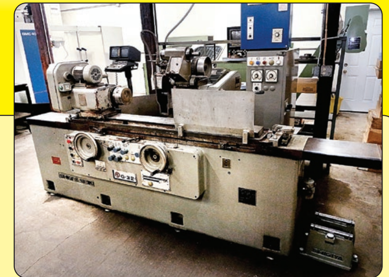
Shigiya GUA-320-100 ID/OD Cylindrical Grinder