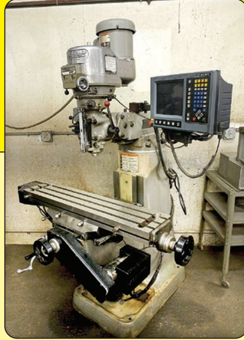
Bridgeport Series I, 2 HP CNC Vertical Mill