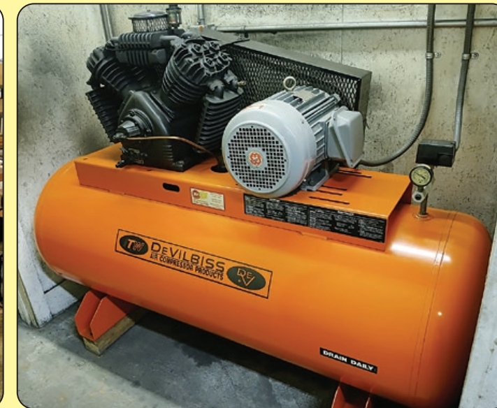
Devilbiss Model 440, 2-Stage Air Compressor