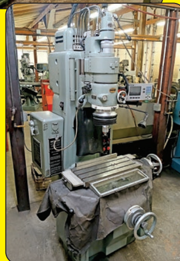
Moore G18 Jig Grinder

TERMS - ONLINE ONLY AUCTION: A 18% BUYER'S PREMIUM IS IN EFFECT FOR THIS AUCTION. Bidders must pre-register on Bidspotter.com 24 hours before bidding. Everything sells on "As is, Where is, In Place" Basis with all Defects whether apparent or not. There are NO Warranties or Guarantees of any kind - It is the Buyer's responsibility to inspect before bidding. Payment is to be made within 24 hours of the conclusion of the auction. Payment may be made with Cash, Check, Visa, MC, Discover, AMEX, or Wire Transfer. A 3% fee will be added with Credit Cards. Removal is the Buyers Responsibility, Expense and Risk.