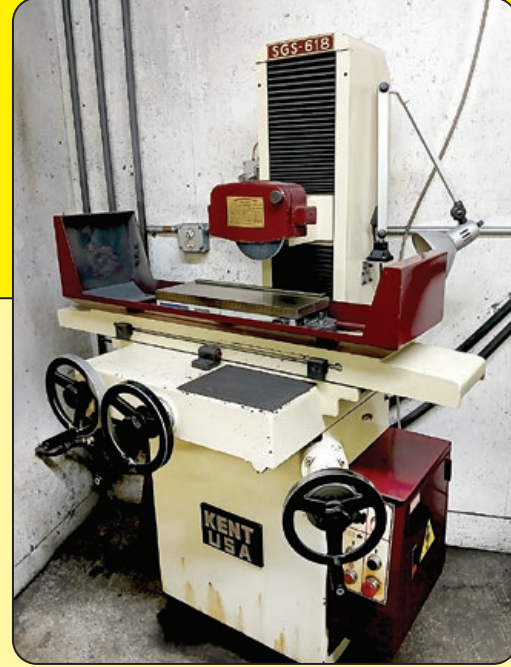
Kent USA SGS-618 Hand Feed Surface Grinder