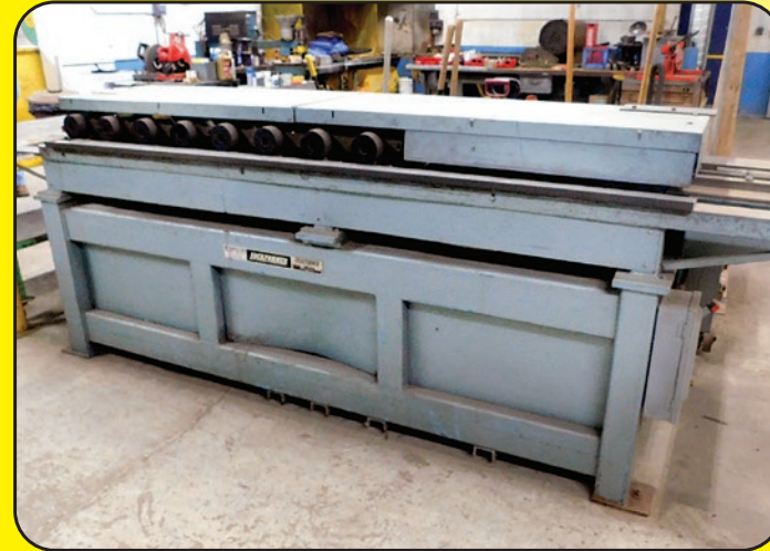
Lockformer TDC Machine

AUCTION BEGINS CLOSING TUESDAY, APRIL 21, 9:00 AM ET