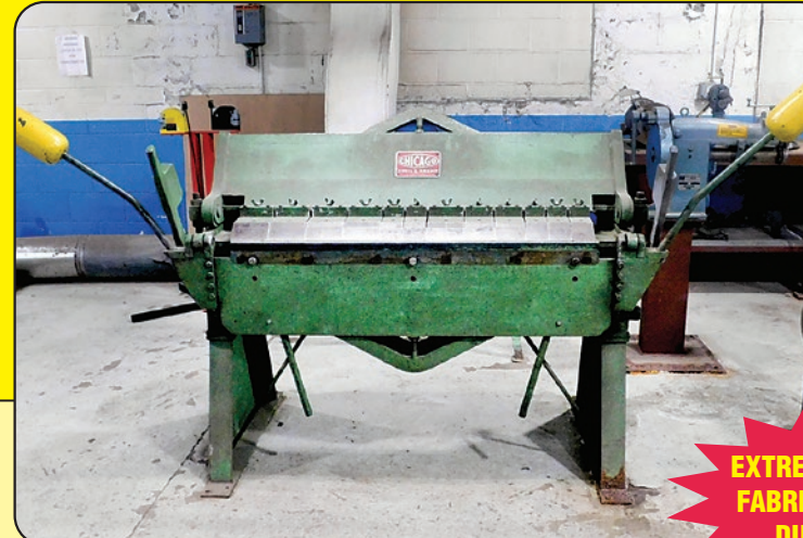
Chicago Dreis & Krump Model BPO-414-6 Box and Pan Brake

AUCTION BEGINS CLOSING TUESDAY, APRIL 21, 9:00 AM ET