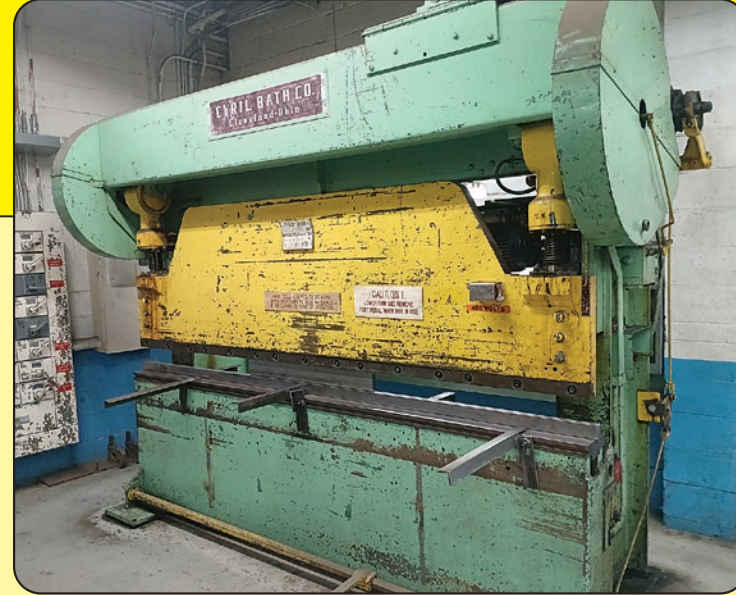
Cyril Bath 100 Ton X 10' Press Brake