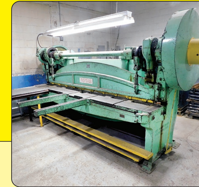
Pexto S-31200 Power Shear