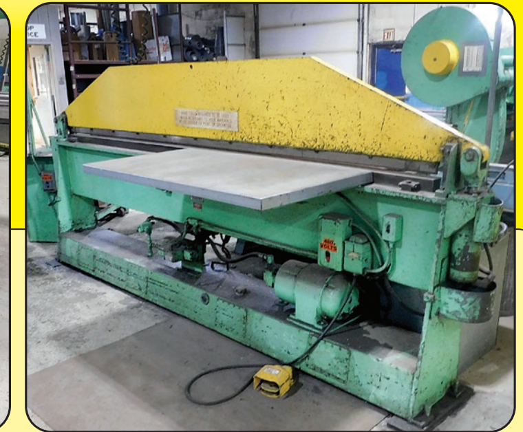
Chicago D & K Speedibender Press Brake