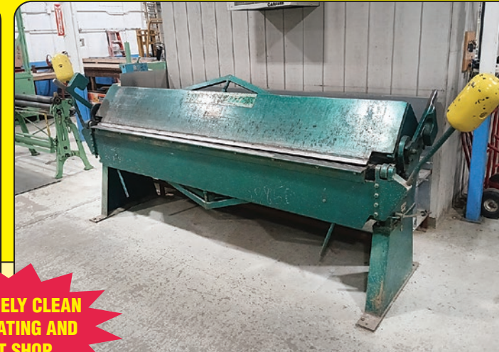
Tennsmith Model HB97 Leaf Brake

EXTREMELY CLEAN FABRICATING AND DUCT SHOP