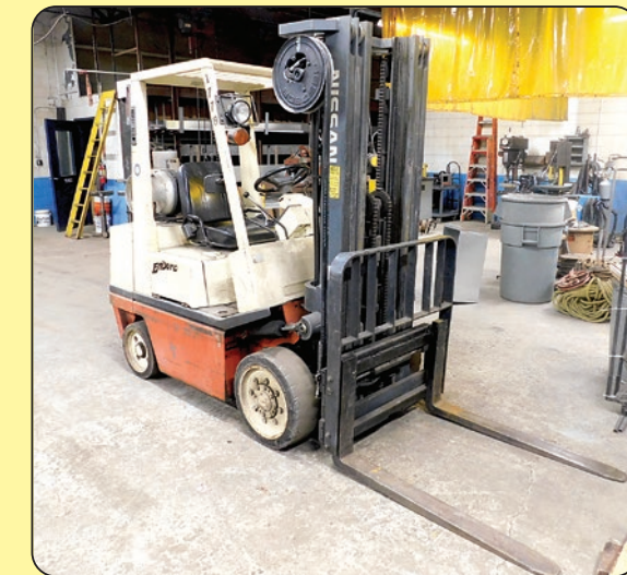
Nissan Enduro Forklift, 4,400 Lb. Capacity