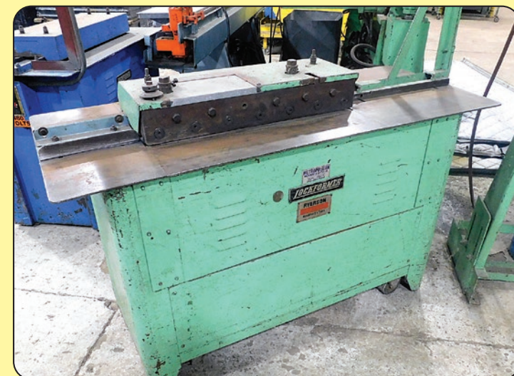
Lockformer Pittsburgh Rollformer

EXTREMELY CLEAN FABRICATING AND DUCT SHOP