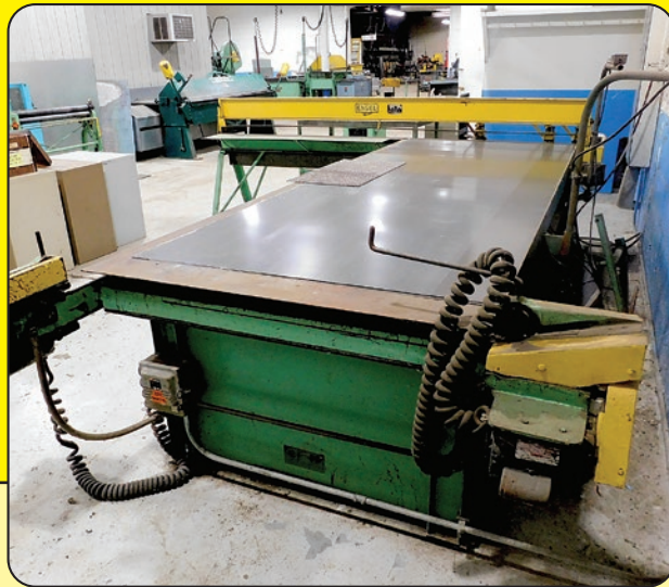
Engel Shopmaster Cutting Table

AUCTION BEGINS CLOSING TUESDAY, APRIL 21, 9:00 AM ET