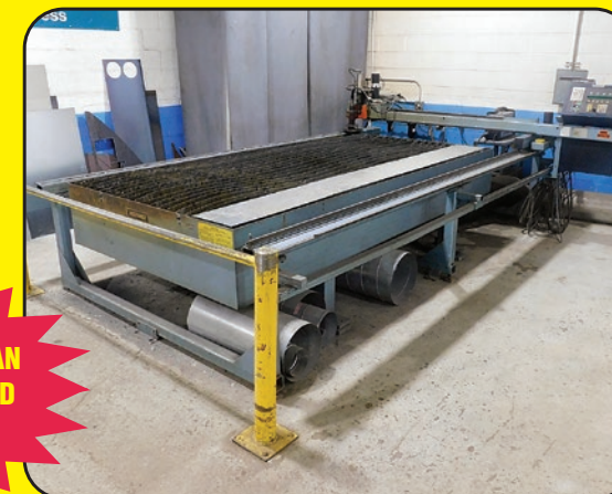
Lockformer/Vulcan Model V1800 CNC Plasma Table

Stephen Thompson • Ohio License 63199566109 thompsonauctioneers.com • 937-426-8446