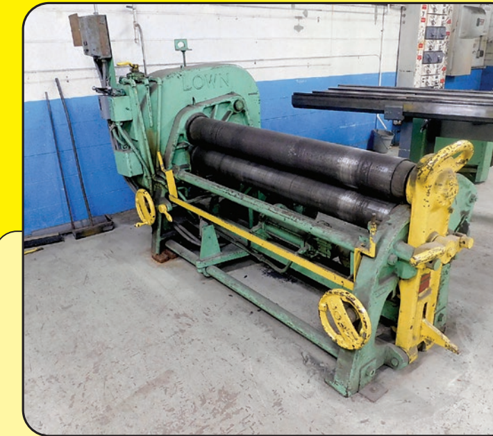
Lown Model B700 Power Roll

Inspection: Monday, April 20, 9:00 AM - 4:00 PM ET