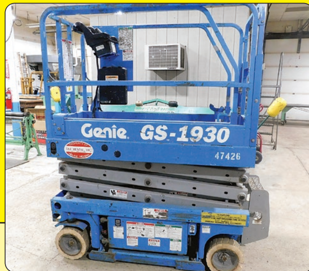
Genie Model GS-1930 Scissor Lift