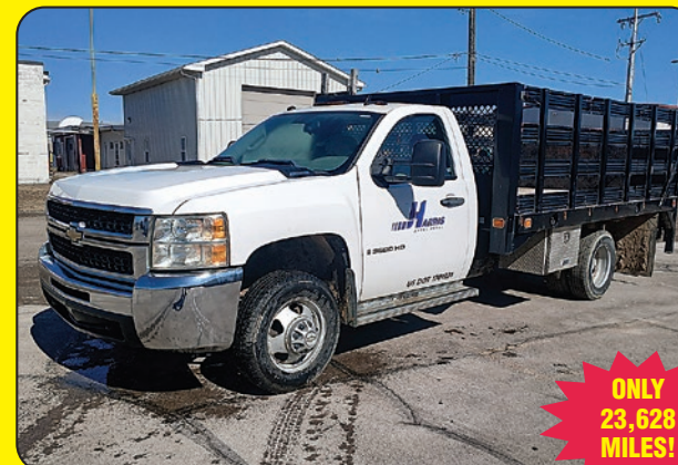
Chevrolet Model 3500HD Stake Bed Truck