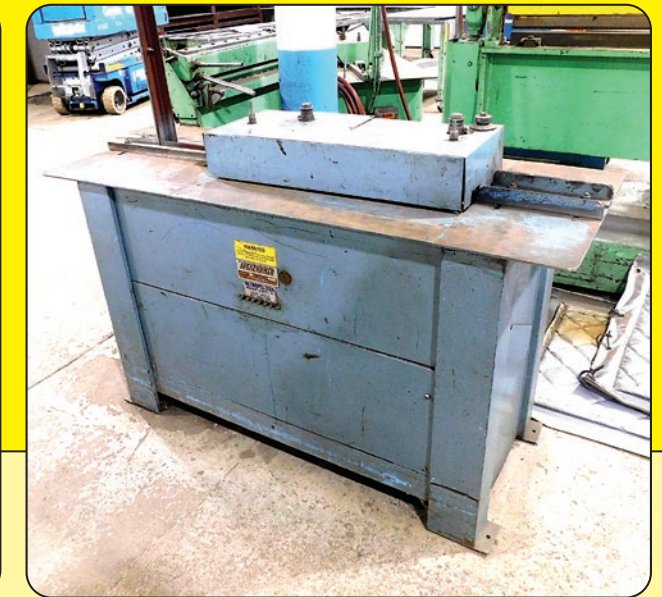
Lockformer Pittsburgh Rollformer