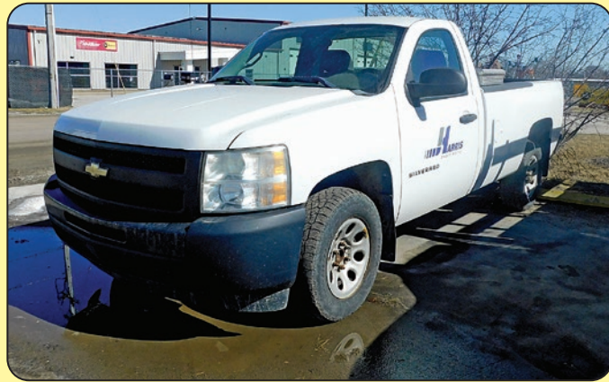
Chevrolet Model Silverado 1500 Pick Up Truck