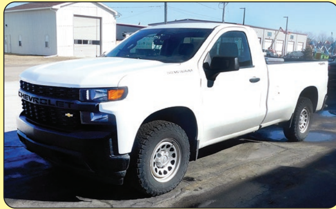
Chevrolet Model Silverado 1500 Pick Up Truck