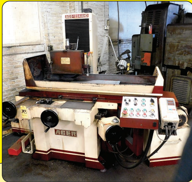
Acer Model AGS-1224AHD Automatic Surface Grinder