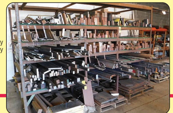
Large Quantity Steel Inventory

THOMPSON Auctioneers, Inc. 937-426-8446 • thompsonauctioneers.com