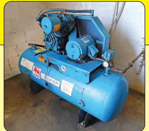
Leroi 5 HP, 2 Stage Tank Mounted Air Compressor