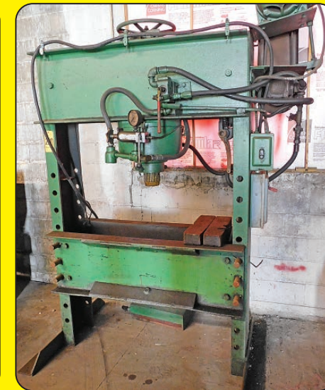
Dake 125 Ton H-Frame Hydraulic Shop Press