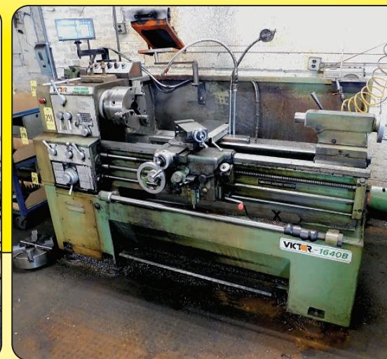
Victor 1640 Tool Room Lathe