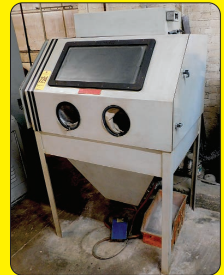
Sand Blast Cabinet with Reclaimer