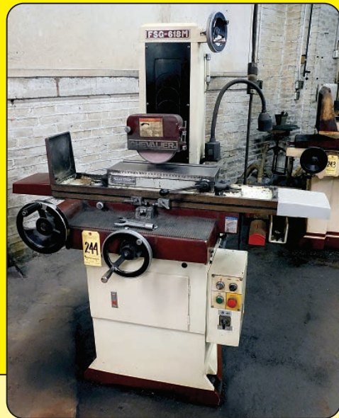
Chevalier Model FSG-618M Hand Feed Surface Grinder