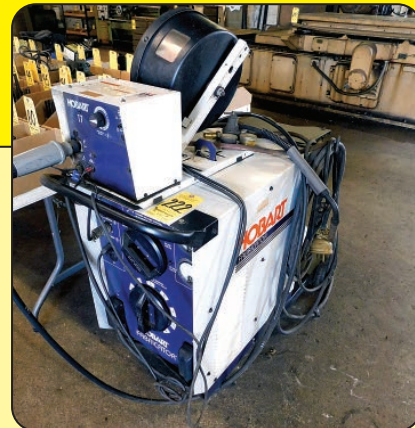
Hobart Model Fabricator Mig Welder