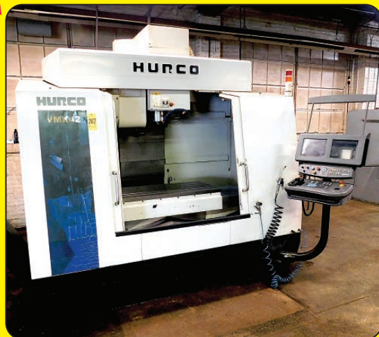
Hurco VMX-42 CNC Vertical Machining Center (1 of 2)