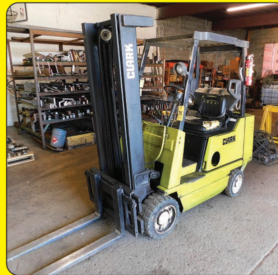
Clark Model GCS25 fork Lift