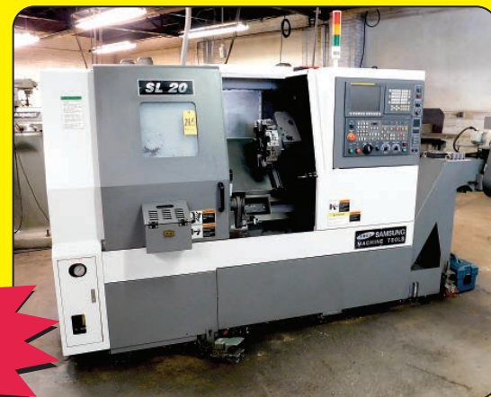
Samsung SL-20 CNC Turning Center