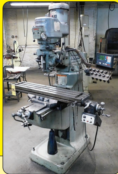
Bridgeport Series I Vertical Mills (1 of 2)