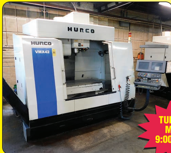
Hurco VMX-42 CNC Vertical Machining Center (1 of 2)