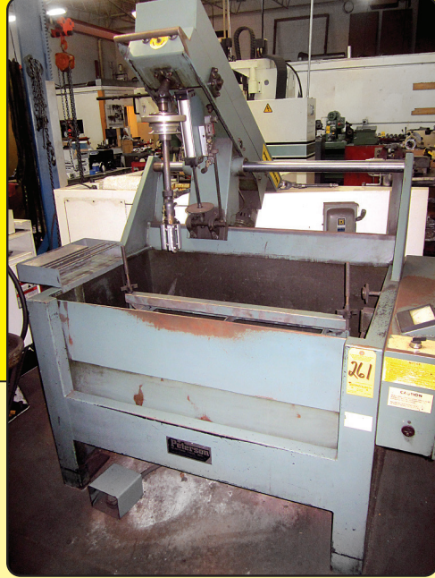
Peterson Model HC-1DP Power Stroker Cylinder Hone