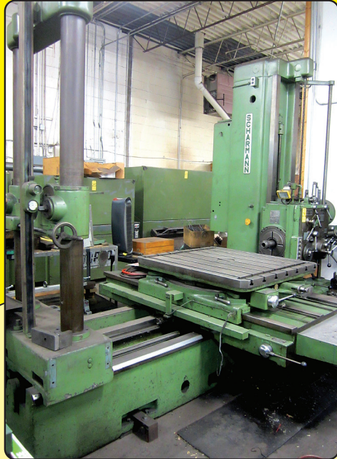
Scharmann 3" Horizontal Boring Mill