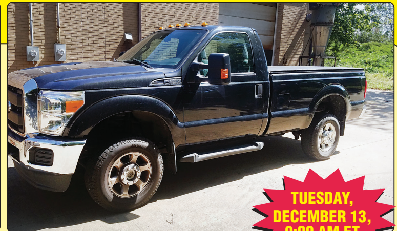
2015 Ford F-250 Super Duty Pick Up Truck