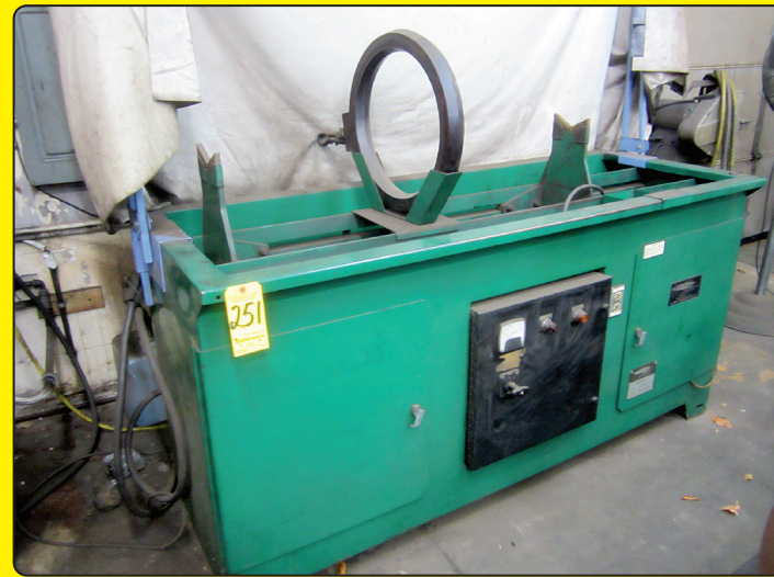
Peterson Model B7500 Magnaflux Machine

To View Catalog & Bid: thompsonauctioneers.com or bidspotter.com