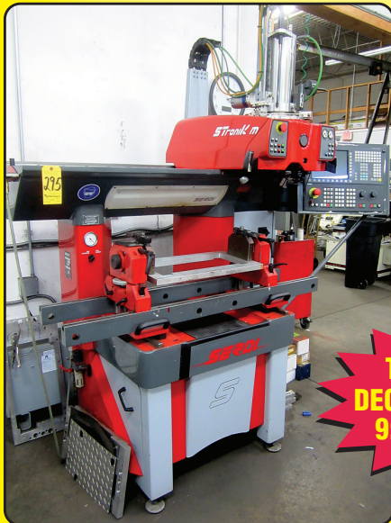
Serdi 3.5 Stronik M CNC Single Point Valve Seat Cutting Machine

12166 York Rd. #1, N. Royalton (Cleveland), OH 44133 (building rear of property)