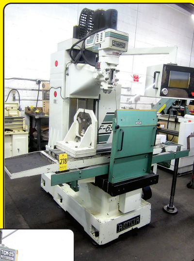
Rottler F65 CNC Vertical Engine Bed Mill

Well-Maintained Precision Engine Rebuilder