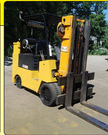
Allis-Chalmers Fork Lift