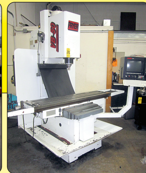
Fryer VB-50 CNC Vertical Bed Mill