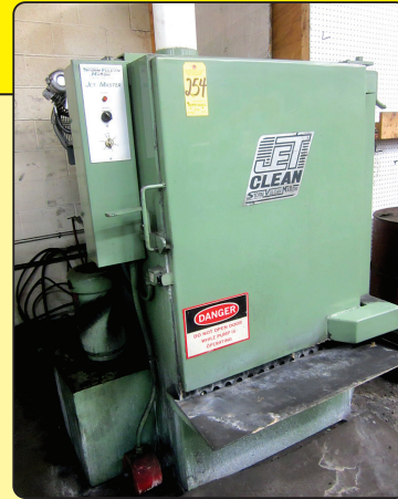
Storm Vulcan Mattoni Electric Heated Jet Master Parts Washer