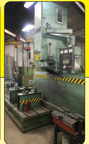
Rottler F-88-E Floor Type Vertical Cylinder Borer & Machining Mill