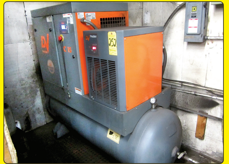
DV Systems Model C15TD Rotary Screw Air Compressor