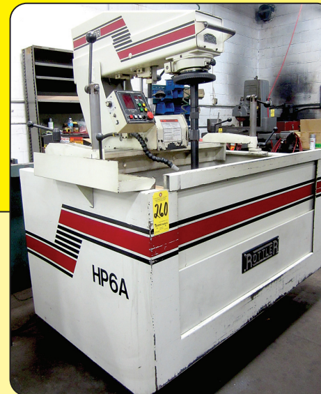
Rottler HP-6A Auto. Diamond Cylinder Hone

Inspection: Monday, December 12, 9:00 am - 5:00 pm or by appointment